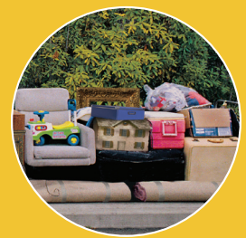
Set out up to 4 cubic yards of bulky junk and a limited number of large items for curbside pickup.