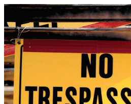
Post "No Dumping & No Trespassing" signs.