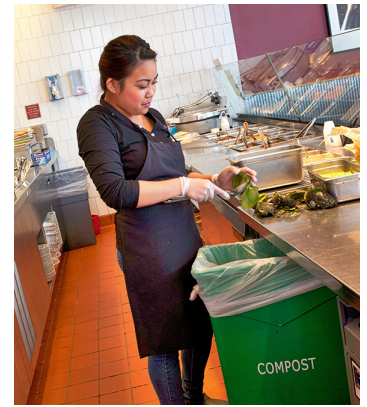
Placing food scraps in the compost bin instead of the garbage helps fight climate change.

Request up to $500 in free indoor compost containers at RecyclingRulesAC.org/containers