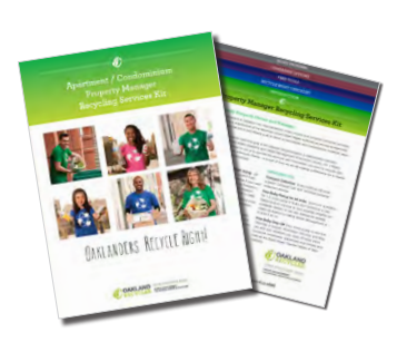
Property Owner / Manager Tool Kit