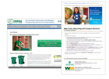
Download & Customize Resident Communications