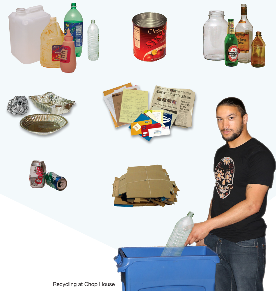
Recycling at Chop House

Recycle plastic containers, aluminum/metal food containers, cardboard, clean paper, glass food and beverage containers