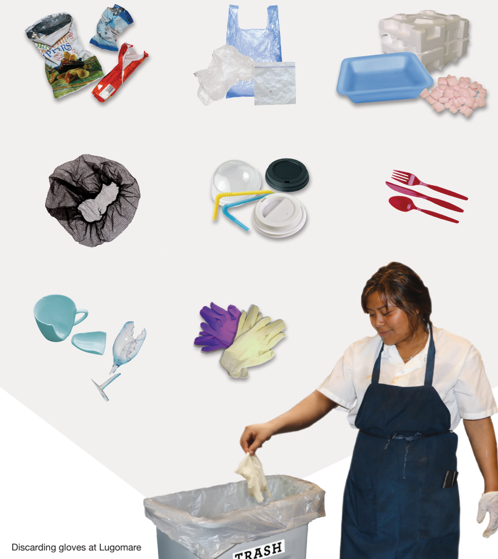
Discarding gloves at Lugomare

Non-Recyclable & Non-Hazardous Materials