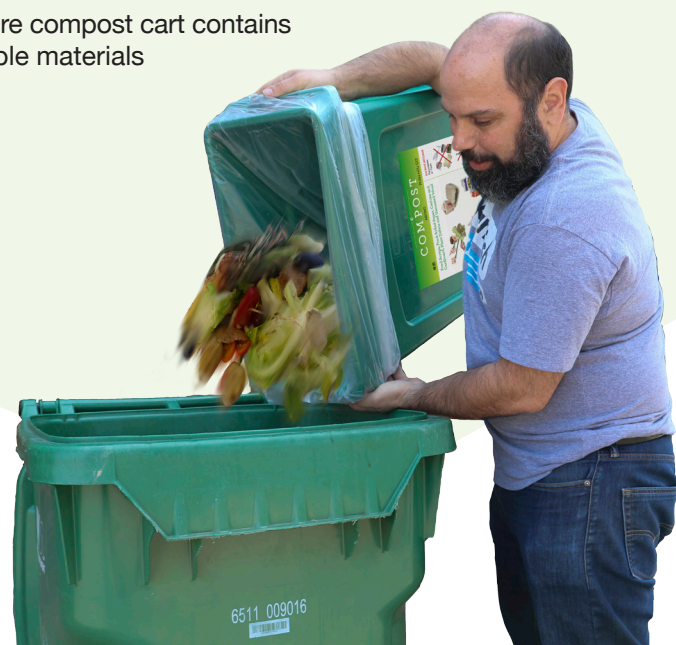
Composting at Calavera